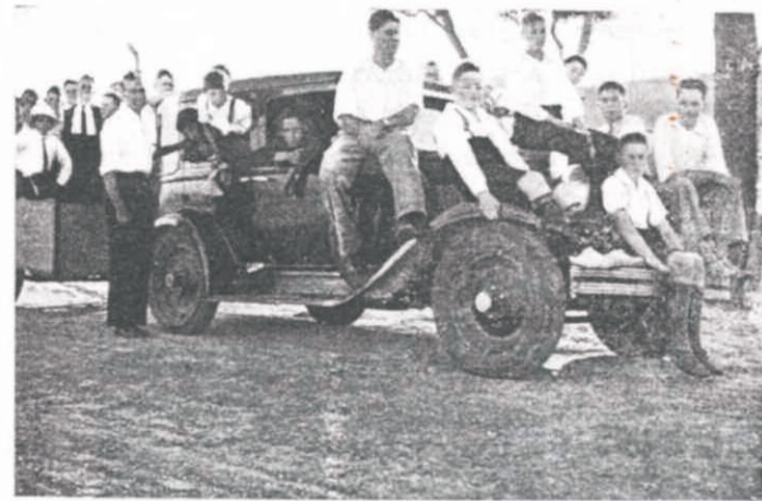
WHERE?—CAMP, OF COURSE