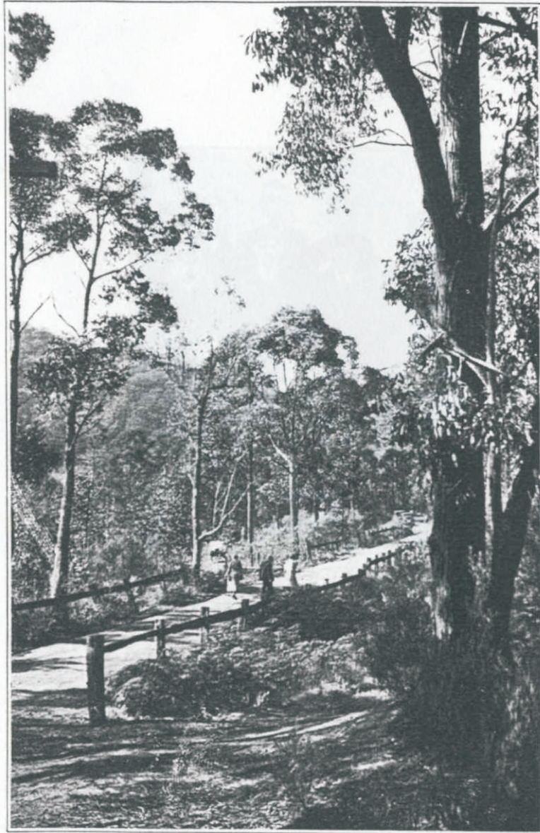
Road at Entrance to Camp Site

The Camp-Fire talks on social and sex problems, combined with a spiritual training, go to build for a safe adolescence and youth-hood. The recreations and hikes in the bracing mountain air add to a physical stamina, a heritage of health, so necessary to meet life's demands. This is aided by lectures on how to maintain a health line of defence against disease, bringing to fruition in the youth a fourfold development of life. Right habits taught and formed prove an abiding heritage. So that the maximum of good and happiness may be experienced in the lives of our young people, the promoters address themselves sincerely to the task of helping to meet the Youth problem in Victoria.