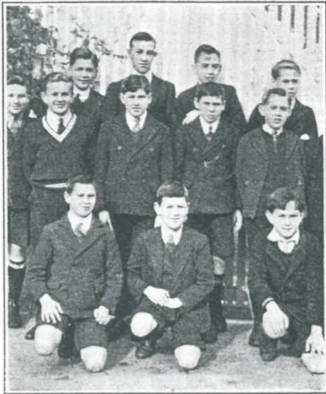
A group of city boys. It is for such as these —our budding manhood and future citizens —that we appeal.