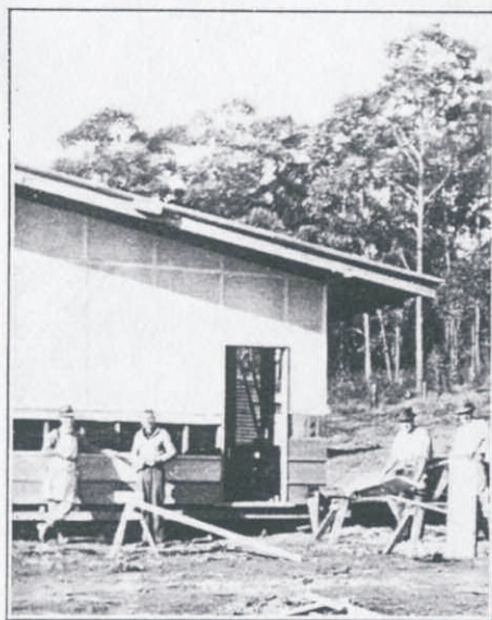
Close-up view of the kitchen nearing completion.