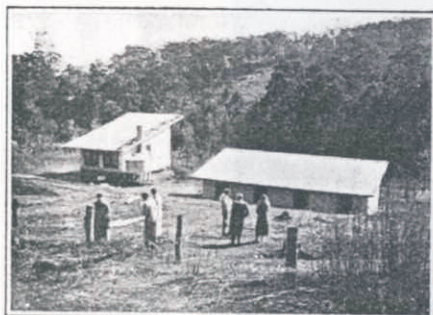
Rear view of No. 1 shack, with kitchen to the left.