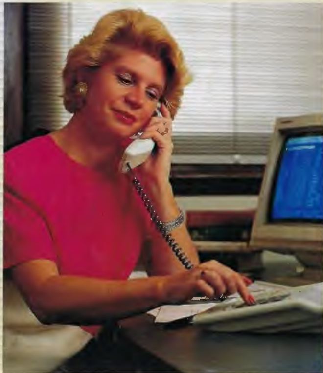
SAVE MONEY ON CALLS