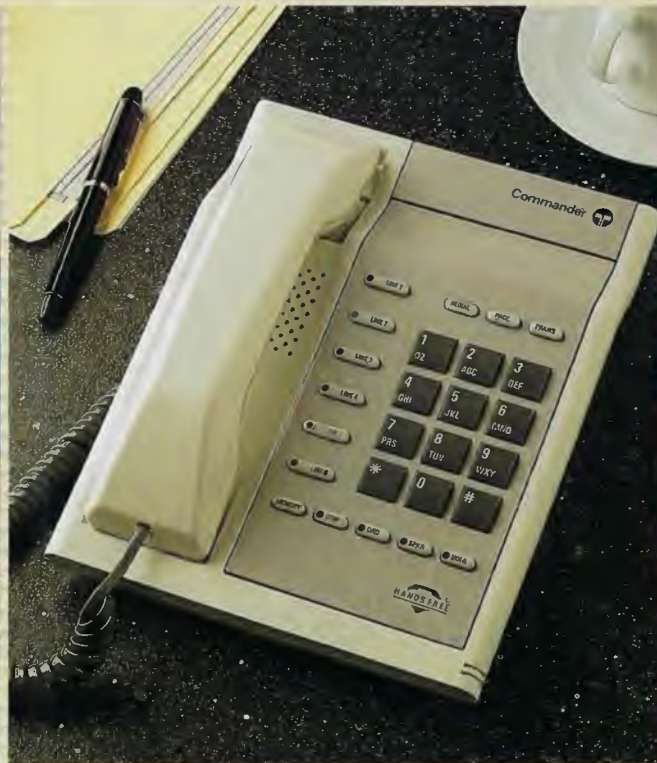
SPECIAL COMMANDER™ UPGRADE AND EXPANSION OFFERS